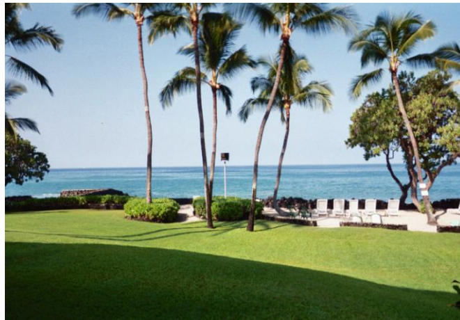
View of grass area from our lanai

Keith from San Francisco, CA says: "If you want relaxation, beautiful views and a great location during your vacation - stay here! I go back every chance I get and have a wonderful experience each and every time".