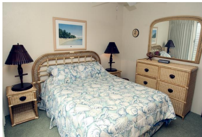
New bedroom set