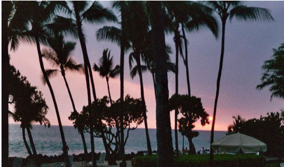
Another beautiful sunset at E-1