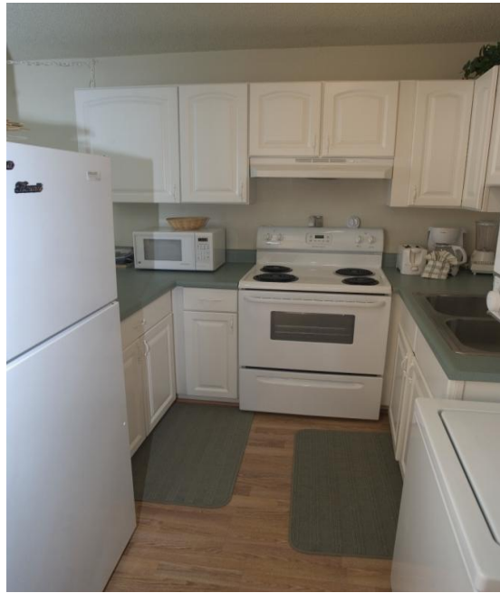
Completely remodeled kitchen.