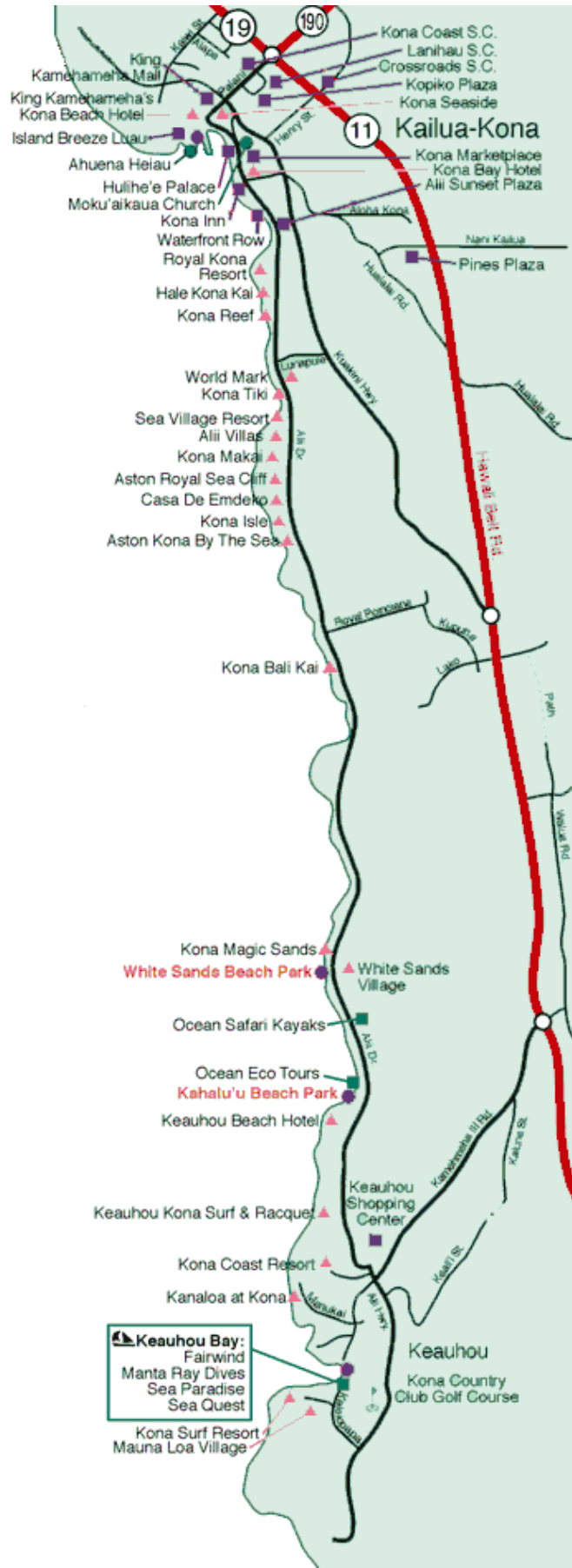
Condos on Alii Drive