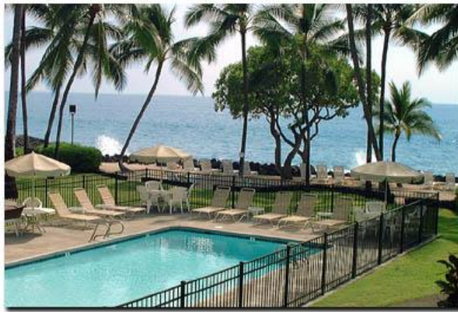
Pool located just outside our unit.